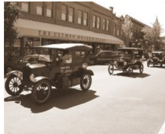
July 9th 2009 outside My Jungle Studios

will end in Seattle on July 12th. It commemorates the Ocean to Ocean Endurance Race (part of the 1909 Alaska Yukon Pacific Exposition) which ushered in the automobile age. There were 56 Model T Fords, 1 from each of the 50 States, and 6 vehicles originally licensed in foreign countries.