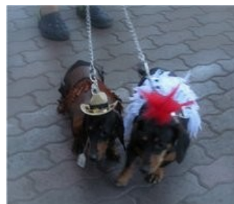
Two Cute little Dachshunds on Parade right outside My Jungle Studios during the Poker Run.

rade, races, stupid pet tricks, costume contests and much more.